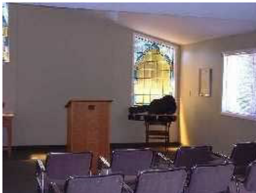
Ganaraska Woods Conference Centre. Conference room.

The theme of this year's retreat is Prayer Changes Us: Surviving and Thriving in a Changing Church . Prayer is a powerful tool that enables us to not only cope but thrive in a changing world and church. Be prepared to learn from the Rev Beth Wagschal, relax and be among friends.