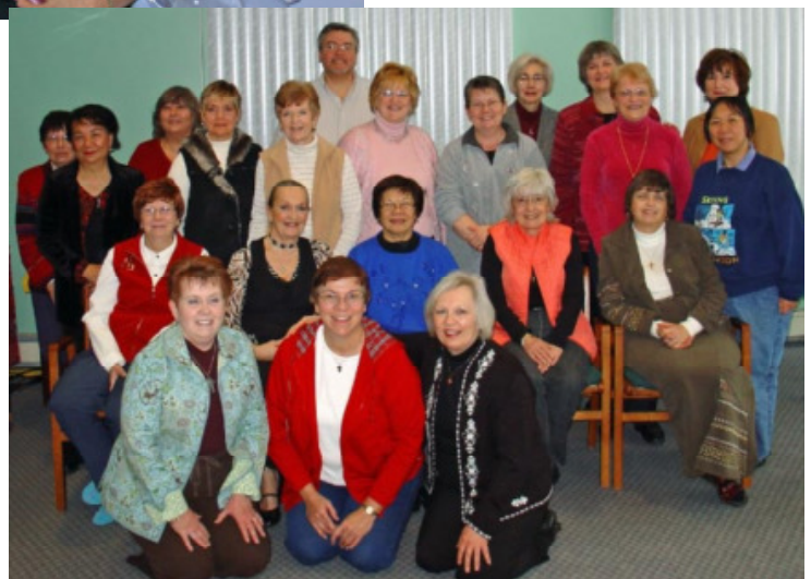
(Above) Attendees at February Parish Nurse Retreat